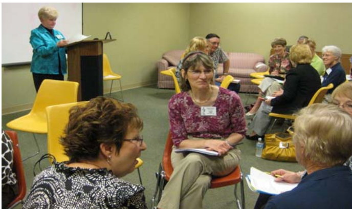
Small Group Discussion