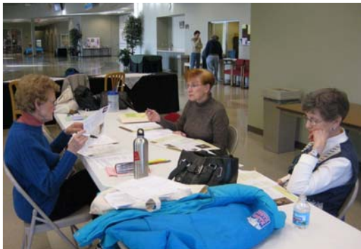
Conference Planning Begins