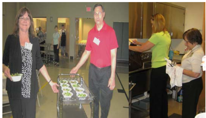
Christ Memorial Shepherds