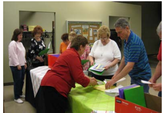
Assembling Conference Folders